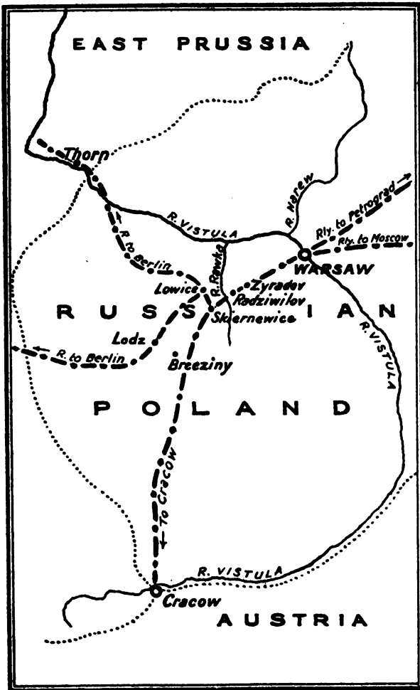
MAP OF THE POLISH FRONT